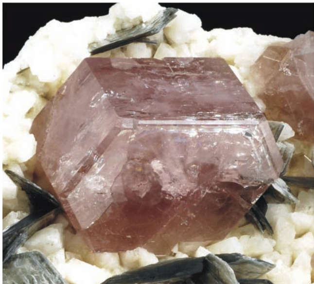
Fig. 1. Fluorapatite crystal exhibiting the common forms {001}, {100} and {101} on a matrix of albite and muscovite, from a granitic pegmatite in the Nagar area, Gilgit district, Northern Areas, Pakistan.

have been named fluorapatite, chlorapatite, and hydroxylapatite, depending on the dominant X^- anion. As the number of new species increased over the years, several comprehensive reviews on the crystal chemistry of the “apatite group” were published ( e.g. , McConnell, 1938 and 1973; Nriagu & Moore, 1984; Elliott, 1994; Kohn et al. , 2002). Recently, in the context of a revision of the mineralogical nomenclature initiated by then chairman of the IMA Commission on New Minerals, Nomenclature and Classification E.A.J. Burke, and aimed at adopting, as far as possible, modified Levinson suffixes instead of adjectival prefixes such as “fluor-”, “chlor-”, and “hydroxyl-”, the above minerals were renamed apatite-(CaF), apatite-(CaCl), and apatite-(CaOH), respectively (Burke, 2008). One of the rationales for that change was the benefit of having the names of these minerals appear consecutively in alphabetical listings and databases.